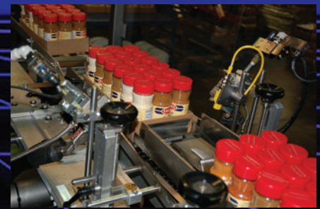
Discharge to Shrink Wrapper