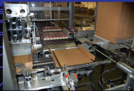
Reliable Tray Setup