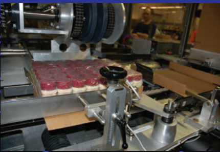
Servo Driven Product Sweeper